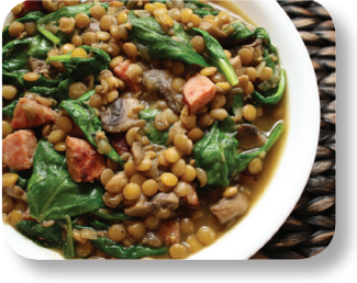
Vary your protein food choices.