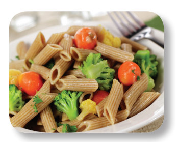
Make at least half your grains whole.