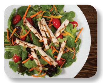
Make half your plate fruits and vegetables.

Before you eat, think about what and how much food goes on your plate or in your cup or bowl. Over the day, include foods from all food groups: vegetables, fruits, whole grains, low-fat dairy products, and lean protein foods.