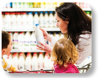
Switch to skim or 1% milk.